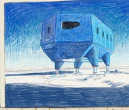
home for 6 months