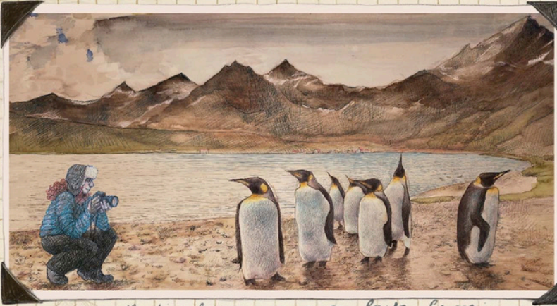
Meeting the penguins on South Georgia