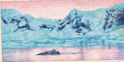
Greetings from ANTARCTICA